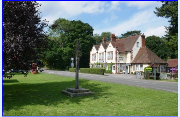
The Bulls Head