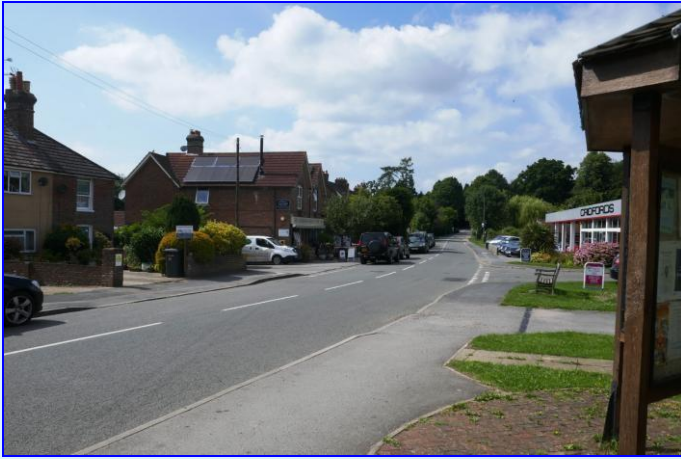
The village shop in The Street